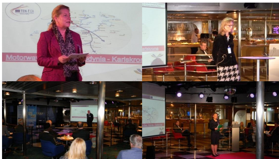
Prominent guests and speakers at the Final Conference