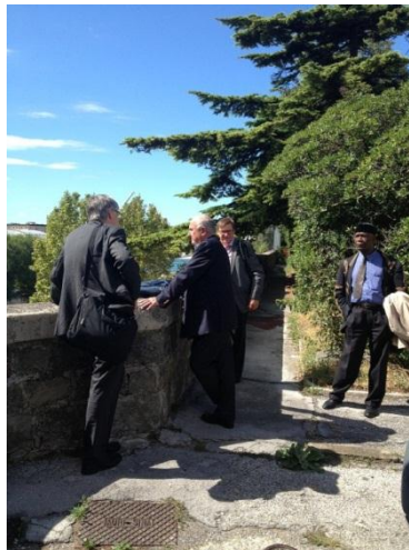
Satisfied delegates after well conducted meetings with two very important Ports in the region of Trieste

Since the last newsletter the project has conducted its last Management Board meeting, which was held in the beautiful scenery of Trieste in September. At the meeting some final planning was done for the upcoming Final Conference together with preparing for some final administrative issues regarding reporting etc. The location of the meeting was chosen in order to give the project the opportunity to visit the ports of both Trieste and Koper. The reason was to learn more about these ports plans for the future and also for the project to marketing and present itself towards these two important ports for the Baltic-Link corridor as such.